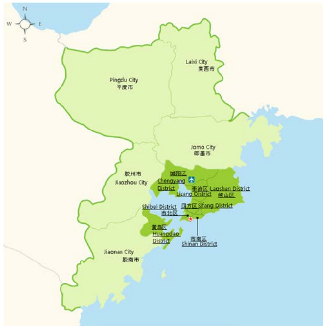
Figure 1: The map of Qingdao city.

As the largest port and capital city in Shandong, Qingdao is the leading power of the Blue Economy zone on the Shandong Peninsula [20]. Qingdao is composed of several districts in the city as well as some coastal cities and ports along the Bohai Bay (see Fig. 1). Qingdao port holds the highest position not only in Chinese oceanic development but also when it comes to global economic contribution. The principal goal of this section is to highlight the sustainable development model of Qingdao port, as one of the main new Silk Road ports, as a case of the Blue Economic strategy in China.