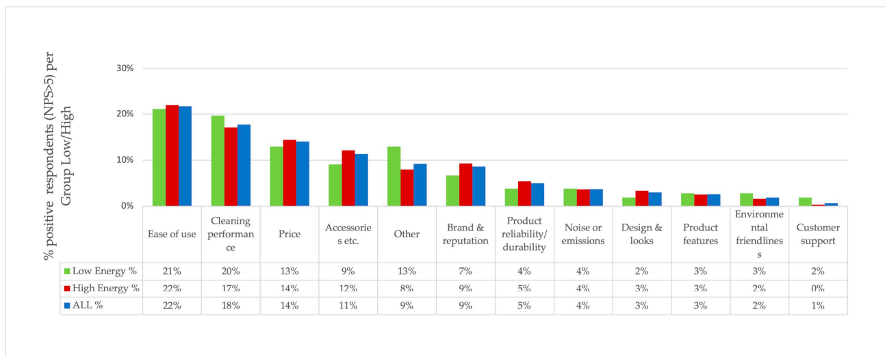
Figure 3. Percentage of the positive customers (NPS rating > 5, N = 832) per low/high customer groups reporting one of 12 main reasons for recommendations.

Figure 3 shows the reasons for recommendation of the positive customers, also presented from high frequency to low frequency. The customers named ease of use, cleaning performance, price, accessories, other, and brand and reputation as the main reasons for promoting, as these attributes account for more than 80% of the reasons to buy. For all customer groups, environmental friendliness is a reason to promote in only 2–3% of the cases.