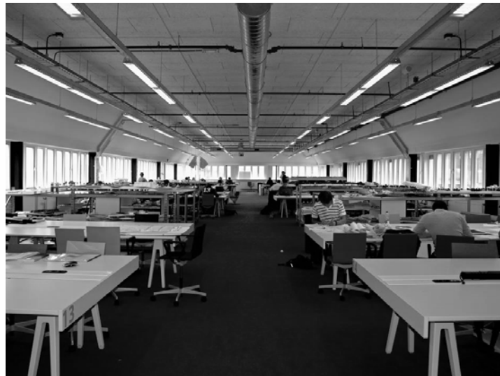
Figure 3 Students at work in the studios

This provided the basis for ⓂMIT. The Ⓜ symbolises restoration in development, as well as the Research Centre which has become an important element, in addition to architecture education. ⓂMIT has now developed into a separate department of the Faculty of Architecture, and addresses architecture education and research at all levels of scale. Three levels of scale are referred to in the name MIT: modification-intervention-transformation. Modification (Van Hees) covers the scale from a single brick to the whole building, intervention (Coenen) from building to city, and transformation (Meurs) from city to landscape. These levels of scale are referred to in both the education and research projects. The Research Centre can act as an impartial investigator of contemporary issues. Twice a year, new design projects are set for the bachelor and master courses, to ensure that they are fully aligned with current developments (Figure 3). This keeps researchers, lecturers/professors and students keen and interested ( http://www.rmit.nl ).