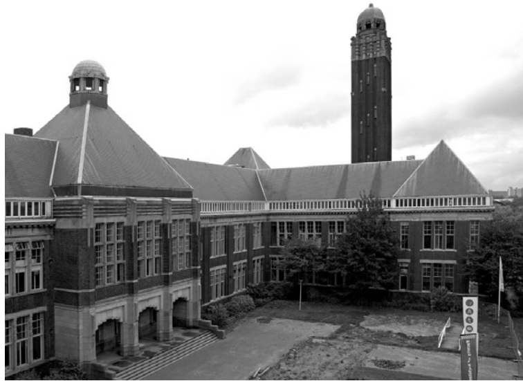
Figure 1 The building of the Faculty of Architecture of the Delft University of Technology in use since September 2008 (The former building of the faculty was destroyed completely by a fire at May 13)