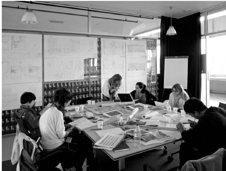
Figure 7 Student workshops at the 10th docomomo_international conference the challenge of change, organised by @MIT in September 2008

excellent basis for making the education more effective and to add a dimension to interests, with solid social and theoretical foundations (Figure 7 & Figure 8).