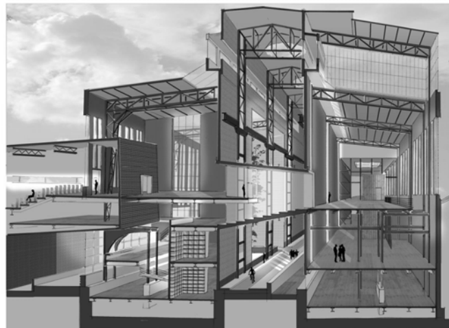
Figure 4 Graduation plan, finding a new use for Kraftwerk Dresden, by Emmy van Eijck

The Master 3 course, the first term of the second year, the research project of the @MIT graduation studio considers transformation in a European city. Dresden was the first city to be studied in this way, and has been followed by Paris and most recently Budapest. The results of the research term are published and where possible an exhibition is organised. Finally, during the graduation laboratory in Master 4, all levels of scale are considered. In the transformation assignment relating to a city or landscape (studied during the preceding term), an existing building or group of buildings has to be adapted to a new programme through appropriate interventions. Both the architectural and structural aspects of the design are detailed, and the @MIT lecturers support the students at all levels of scale. We aim for short lines of communication, where the lecturers coordinate their work effectively. In this way the buildings and modifications to the materials can be designed and detailed within the historical context.