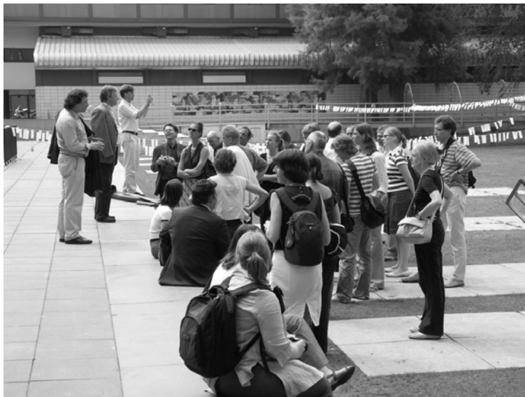
Figure 8 @MIT personnel on a trip to Tilburg