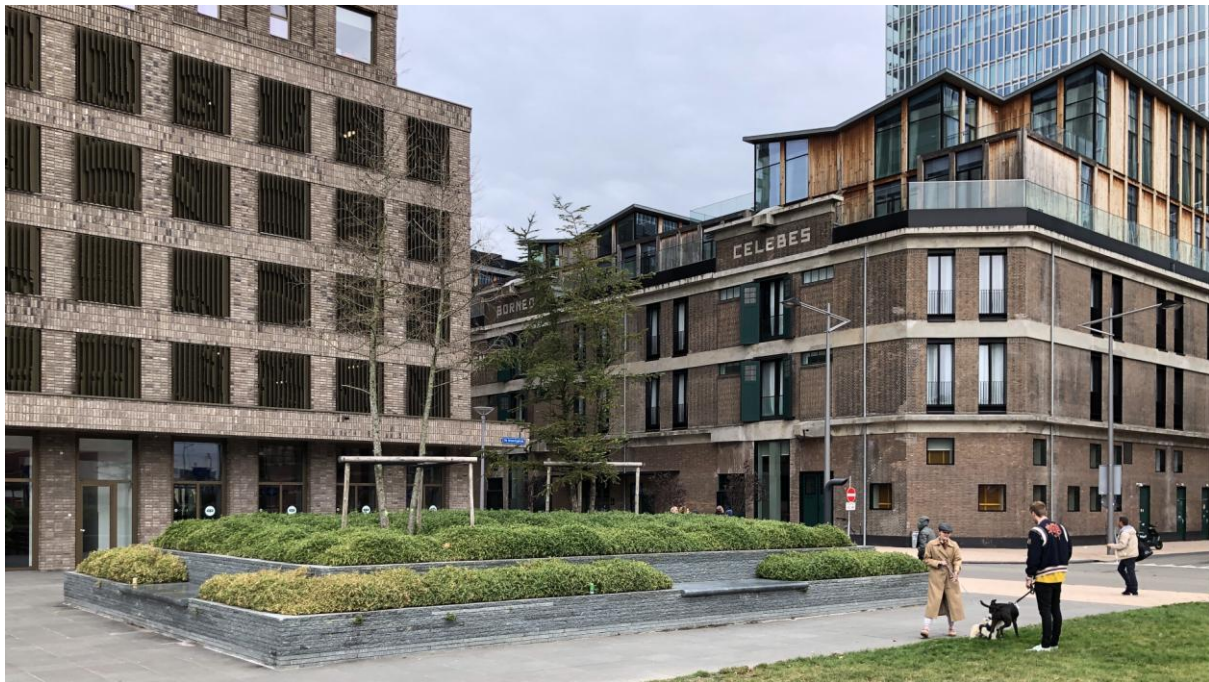
Figure 7. Pakhuismeesteren at The Kop van Zuid. (© Maurice Hartevelde, 2021).

chemical and petroleum products, and/or more and more container ships 26 . Not surprisingly, this bridge is dominant in mental maps of the inner city of Rotterdam. From the semiological angle again, the unique design of the bridge, as a symbol, is supported by its views. This sticks to the brain. The perspective on material signs, which it offers, represents the dominant story on the industrialized world port. In addition, again, when taking a closer look, the placement of signs, similarly communicating the flows within the port-city, manifests itself much richer within the urban fabric of the city. All kinds of port-city-related urban places, elements, buildings, and signs and symbols are present in the minds of people too, as studies show, however often this is not explicit when thinking of port-cities (Hartevelde 2021).