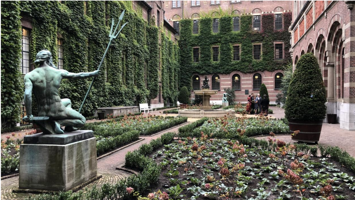
Figure 9. Inner Court of the Rotterdam City Hall.