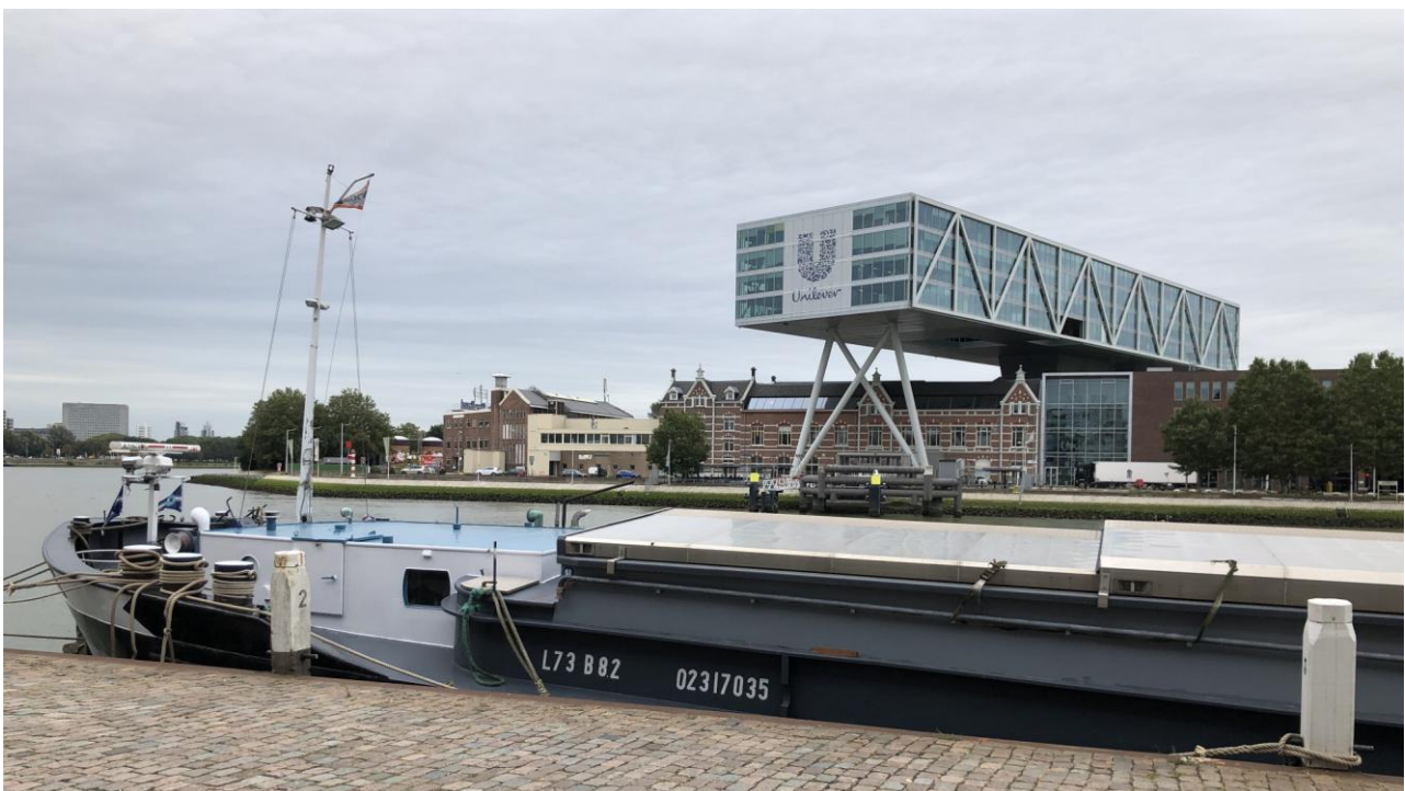
Figure 1. New Meuse, with the building 'The Bridge / The Quay'.