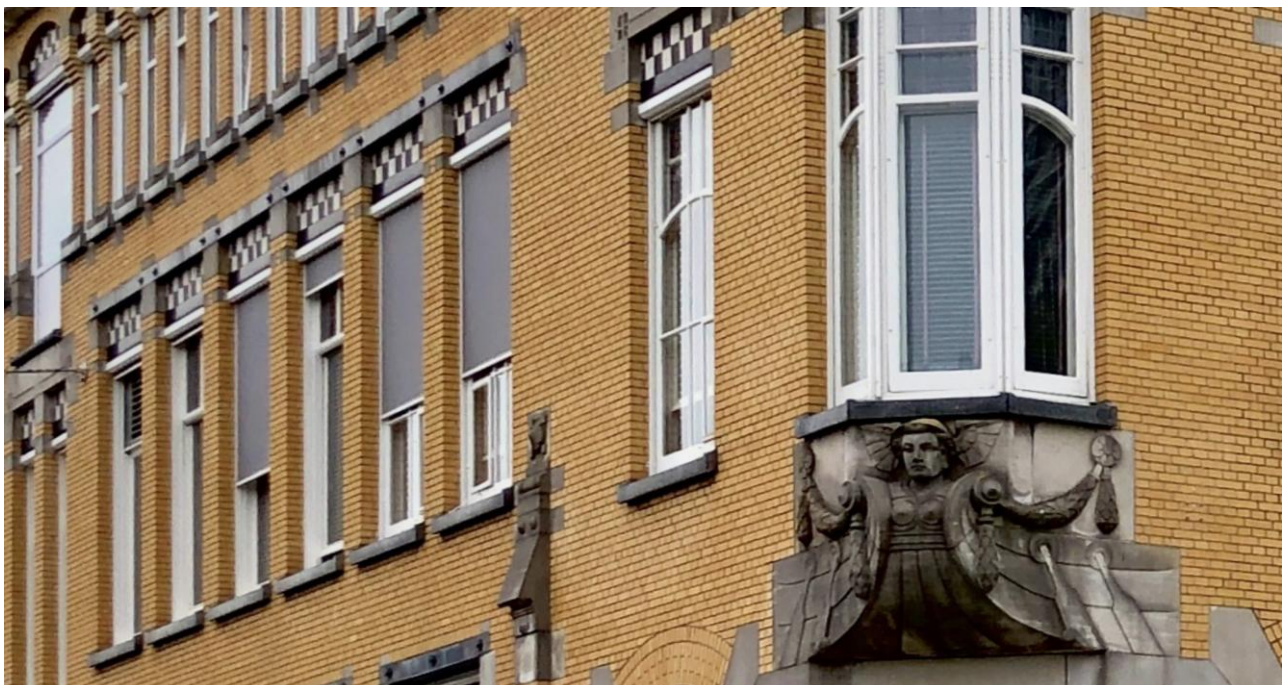
Figure 3. Former Lloyd headquarters in the Maritime Quarter, Rotterdam. (© Maurice Hartevelde, 2021).

symbols of any kind, manifested through urban and architectural design and in conjunction with public life, are relevant in portraying public space as port-city entities. They have to be described in their ways of conveying specific place-based port-city meanings, against the background of past events. These signs and symbols need to be situated in the concrete and material world forming the public space. As such, they are “shaped by and shapes” the material world people live in. They are not only at our disposal in public space, more so, signs and symbols are “being more fundamentally grounded in the earth and the spaces in which we live.” This is where the biographical study makes use of syntactic approaches grounded in the heart of ‘geosemiotics’, namely: situated semiotics. It composes the narratives on the basis of data gathered around the setting and elements which are unique for a specific place. Consequently, the study excludes those which appear in “multiple contexts but always in the same form”, as alike universal utilities or brand names and logos, or those which are “are out of the place”, respectively understood through decontextualized and transgressive semiotics (Scollon and Scollon 2003, 145-146, 159). Particularly, this methodological elaboration brings together perceptual gestalt with activities, essential in understanding place, “to construct representations of the topological as well as the typological aspects of being-in-the-world” 7 .