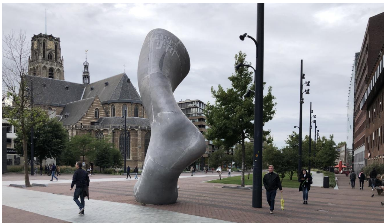
Figure 4. The Dam ' at Binnenrotte Square, Rotterdam.

(1907) 14 . Particularly in this area, a story on port-city public spaces can be rich in their signs and symbols. The place is full of port-city-related references, yet not always explicit when thinking of port-cities (Hartevelde 2021).