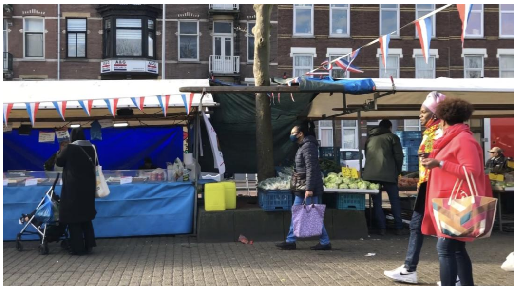
Figure 8. Afrikaanderplein, Rotterdam. (© Maurice Harteveld, 2021).