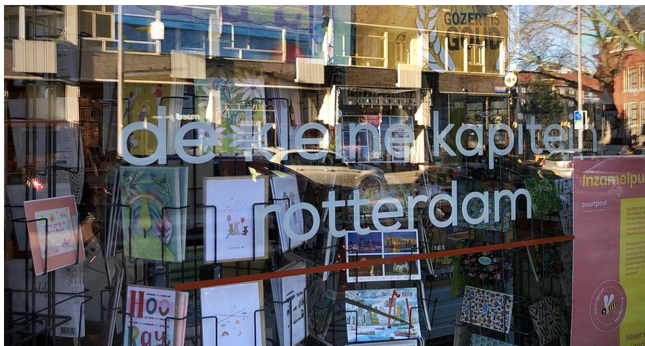
Figure 2. De Kleine Kapitein [The Little Captain], children's bookstore in the Inner City of Rotterdam. (© Maurice Harteveld, 2021).