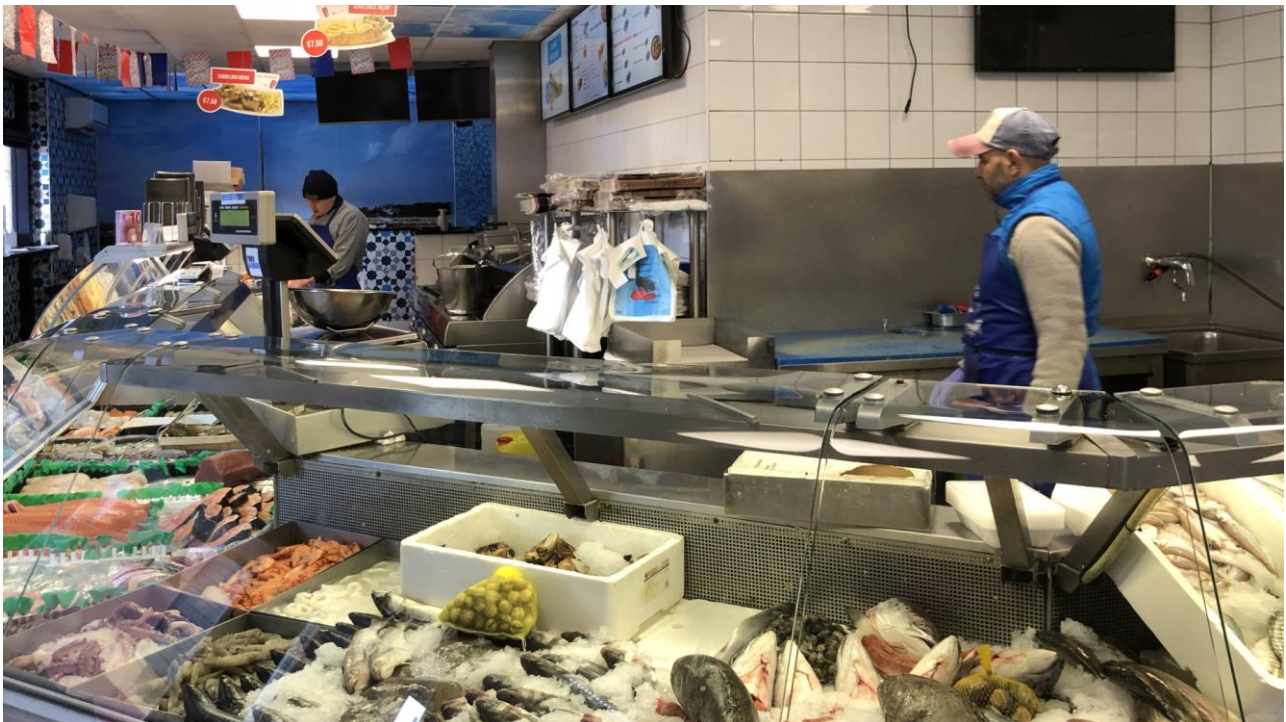
Figure 5. Fish store 'Marost' at the Zwaanshals, Rotterdam North..

Former presence of water can be discovered at a second medieval witness of the port-city. By following traces 'downstream', just south of the church and going below the surface, people can find a remnant wall, which is floating on stilts in the interior public space of Blaak station above underground train tracks. This wall, having a clear damp too, used to be part of the Blaauwen Toorn (1606) 20 . This was one of the two defense towers built five years after the Rotte quay was strengthened by brick walls. According to historic maps (Braun and Hogenbergius Ded. 1572), the