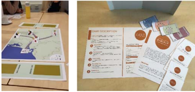
Fig. 1. Prototype of the Trust Game