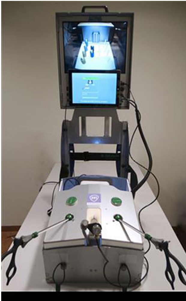
Fig. 3 The LAPSTAR box trainer (Camtronics, Son en Breugel, The Netherlands) equipped with the ForceSense sensor and the hard- and software package that allows for tissue interaction force and 3D instrument motion measurements

of task 2. The performance of the first and the last repetition was compared between groups. The total time needed for the experiment was 40 min per participant.