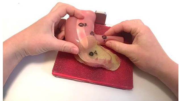
Fig. 2 Haptic exploration of the silicone ileocecal model. The circles and numbers indicate the place and the order in which a needle should be driven through the structures

In order to get used to the equipment and compare baseline laparoscopic performance, both groups started the experiment by performing three repetitions of a standard laparoscopic “post and sleeve” task (Task 1) on a box trainer. Beforehand, they watched video-instructions on how to perform task 1. Subsequently, all participants watched the video-instructions for task 2: a task on a silicone life-like anatomic ileocecal model. Group A (Touch group) was instructed to take the anatomic model in their hands and to explore the geometry and different structures of the model with their hands (Fig. 2) for the duration of two minutes. The subjects in Group B (No-Touch group) were not allowed to touch the model but were instructed to attentively look at the model from all angles for a period of 2 min without restrictions on the distance between face and task. Thereafter, both groups performed ten repetitions