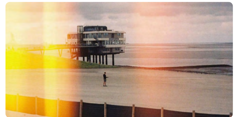
Figure 1: Ems bay seen from Delfzijl beach, Dutch Wadden Sea.