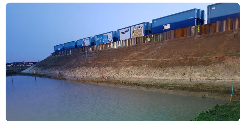
Figure 1: Eemdijk full-scale test; dike with sheet pile reinforcement prior to failure.