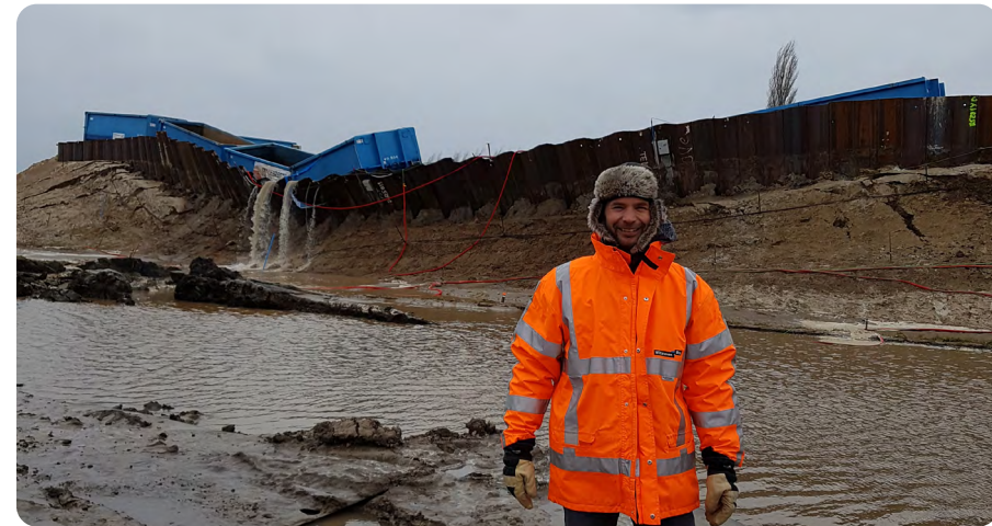
Figure 2: Eemdijk full-scale test; dike with sheet pile reinforcement after failure.

In the Netherlands and other deltas globally, very soft and highly organic soils are omnipresent. With the adjustment of the CPT-based classification these organic soils are better classified. Furthermore, new CPT-based correlations are developed, for example the soil unit weight for soils, ranging from sands to peat. A new theoretical model (CSR model) was developed, implementing the Limit Equilibrium Method (LEM) on slope stability analysis. The new relationship obtains the undrained