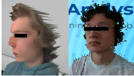
Fig. 3. Left: indexed mesh model, right: point cloud model

less visually complete (see figure 3). Users have the option to alter the appearance of the 3D model, for both methods of rendering, as seen by them in real time. This includes: toggling the visibility of the 3D model, changing between the two model types, changing the resolution of the 3D model and changing the position of the 3D model within the classroom.