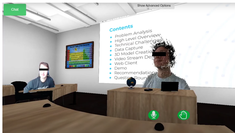
Fig. 5. Student's view of the holographic teacher during lecture.

Students are able to see and hear one another within the virtual classroom environment facilitated by their browser. The placement of students is such that it mimics the rows of seating in a physical classroom. A chat facility is also available as an alternative to interacting with audio. Students are provided with the typical options of an online meeting platform, such as disabling their video or microphone. Most importantly, the students can view and listen to their teacher as a hologram within the virtual environment (see Figure 5). This allows more naturalistic interactions and communication between teachers and students.