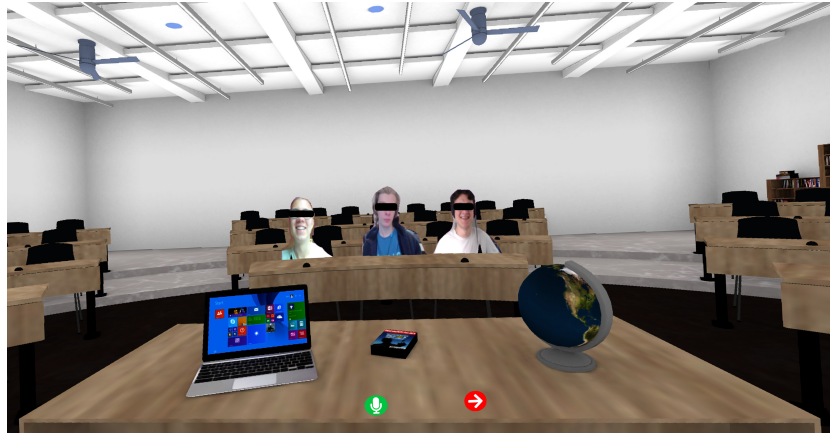
Fig. 1. Teacher's view of the classroom.

The services provided by the "HoloLearn" prototype must be accessible to all students and support lectures with large number of students. Therefore, the project uses a browser based 3D classroom environment to allow students with varying computer resources to access lectures (see figure 1). However, it should be noted that the holographic lecture can be hosted in other ways such as within a virtual reality environment. However, due to virtual reality glasses currently not readily available for all the students, we decided to first implement the browser based platform. The browser based classroom environment facilitates student to student interaction, displaying of the teacher's 3D model and sharing of on screen content along with audio channels. The goal in constructing the prototype classroom was to identify and assess different technologies that are capable of supporting such an experience.