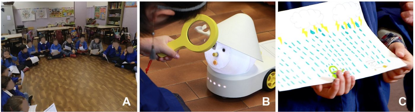
Fig. 1. Three phases of the experience: a) Introduction of the robot and preparation; b) Analysis of the robot; c) Making hypothesis about robot past

and a clear call for action. Here a transcript of the educator's initial speech: "I found this little thing, yesterday in the late afternoon, close to the school garden. I started to look and it reminded me of a robot, but I am not sure because it appears inanimate. None of my attempts to get a reaction were successful. It did not show any kind of reaction. Maybe it's just a broken toy. But as I would like to know more about it, I asked for the help of two robot experts. They arranged a meeting at the school today, because I found this thing close to here. And since the meeting is taking place at the school, I thought that you could also help analyzing it, and see if we can come to understand what it is and where it came from... so maybe we can bring it back home."