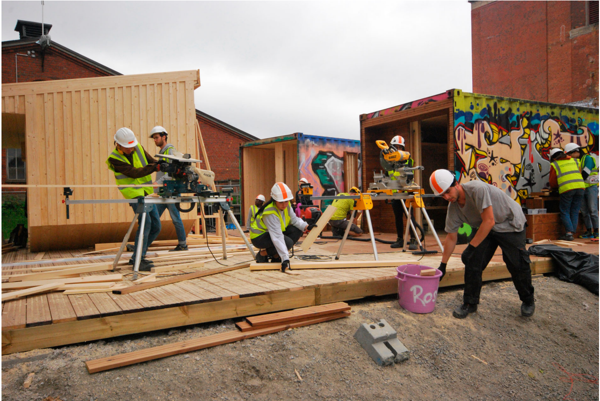
Figure 5. Students at work at the construction site, photographed by Klaske Havik, 2019

the groups, there was help from the local builders and the main teacher. Like in the movement classes, also in the construction phase of the project, there was ample space for improvisation.