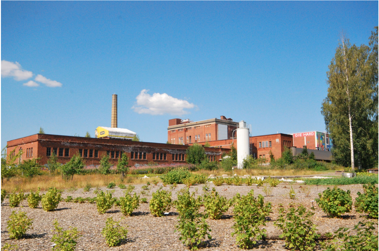
Figure 2. Terrain of the former pulp factory, photographed by Klaske Havik, 2019

active with ongoing research at the site, related to co-creation and self-organisation in urban development. In this way, Tampere university acted as a connecting link between academia and practice, and between the different actors in the project. Finally, the Kaarikoirat skaters group, who had already built up substantial experience with building on the Hiedanranta site, provided the lead in the construction process on site. 12