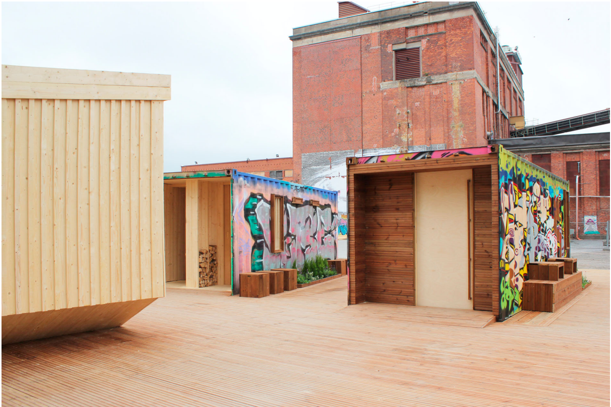
Figure 9. Ensemble with view over the performance space, along the sauna towards the storage and dressing room, photographed by and courtesy of Sophie Hengeveld, 2019

lake. The project has become a social connector in Hiedanranta, bringing together different atmospheres and actors. The sauna and connecting platform contribute to the social and cultural life for the site and community. As a public facility, the sauna and performance platform make new embodied encounters possible, between different users and visitors of the area. The buildings and structures have now been inspected and approved as public buildings and spaces, and will remain in use at least for the next five years. Today, the sauna is one of the public saunas in Tampere. Whoever wants to visit it can ask for the key at the manor house.