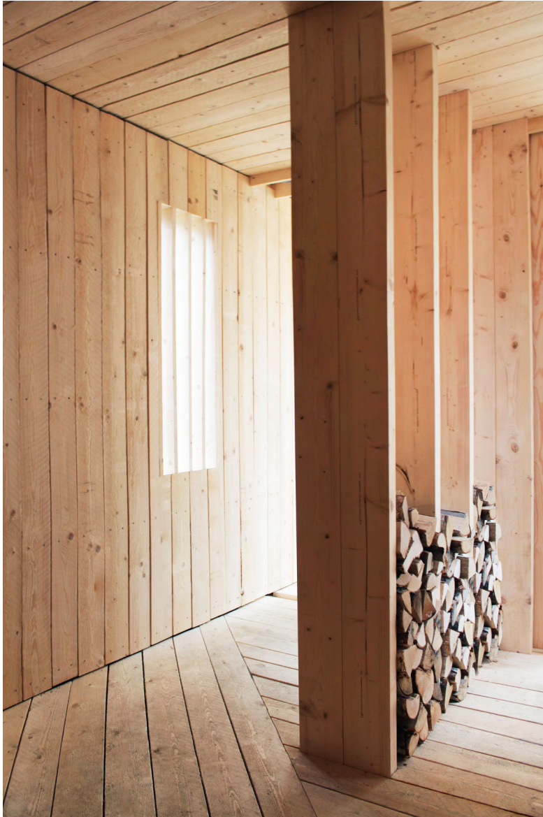
Figure 8. Dressing room, showing rhythms of lines and light, photographed by and courtesy of Sophie Hengeveld, 2019

their pits, they appeared in their full height to be used as small tables. Attention to the site and its multiple users was translated into a series of connections and invitations, such as the stairwell leading down to the garden and manor house, the curved edges at the factory side which provided ramps for the skaters, and the deliberate voids to grow plants alongside the containers (Figure 9).