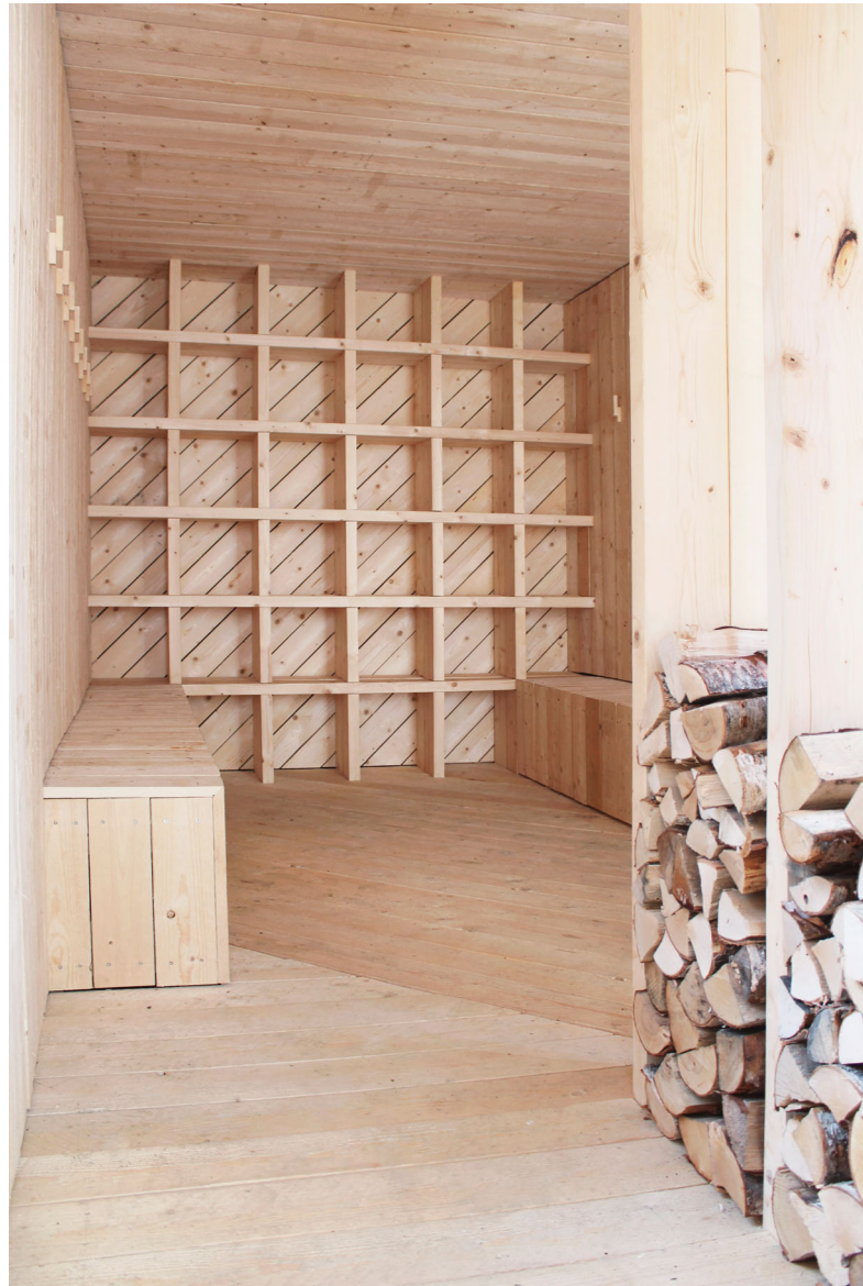
Figure 7. Dressing room showing the shift in directions in the rear wall, photographed by and courtesy of Sophie Hengeveld, 2019

manor house. The walls were made of timber planks in a vertical rhythm. The door handle, as a reference to many traditional saunas, was made out of a natural tree branch.