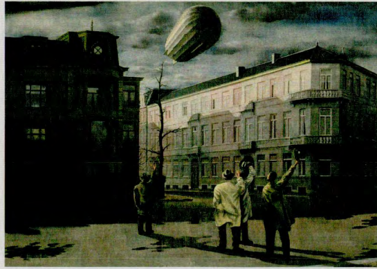
Carel Willink, The Zeppelin , 1933, Collection Museum MORE, Gorssel.

authoritative practices. There is also little recognition except for a few internationally operating rendering agencies. In the case of architecture, this means the loss of a practice's distinctive signature.