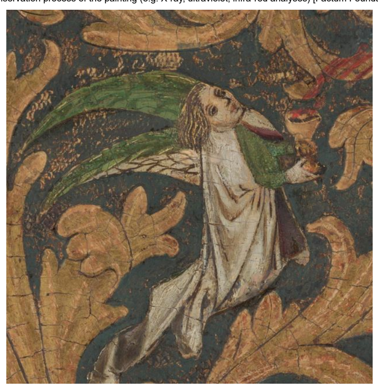
Figure 3. Color photograph

Additionally, the digital model will be supplemented with data resulting from other types of material research that will be carried out during the conservation process of the painting (e.g. X-ray, ultraviolet, infra-red analyses) [Factum Foundation 2021a].