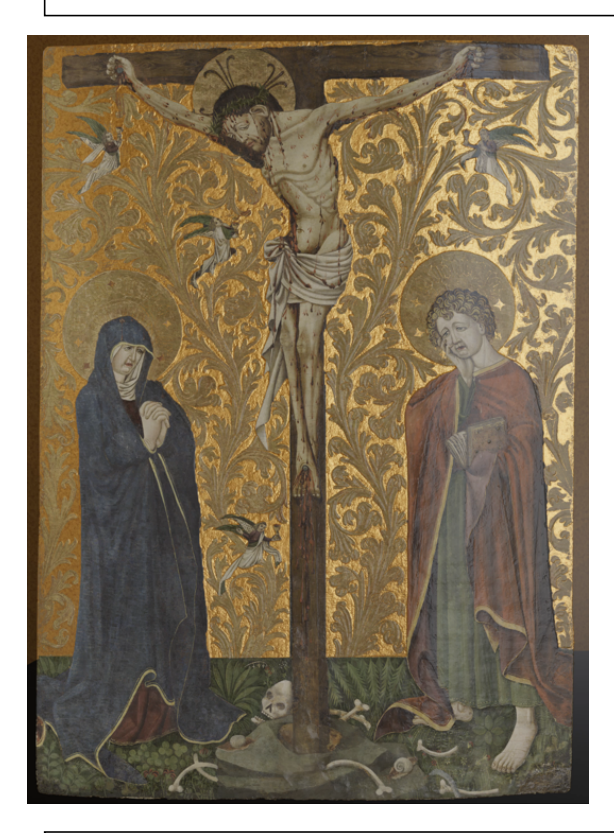
Figure 2. Digital photo reconstruction where the azurite layer was removed and a golden background was added – Ruben Wiersma