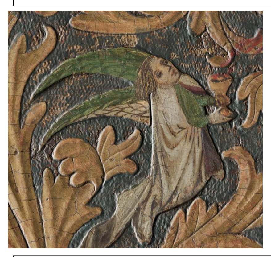
Figure 5. Color and height combined Color photograph – Made by Factum Foundation