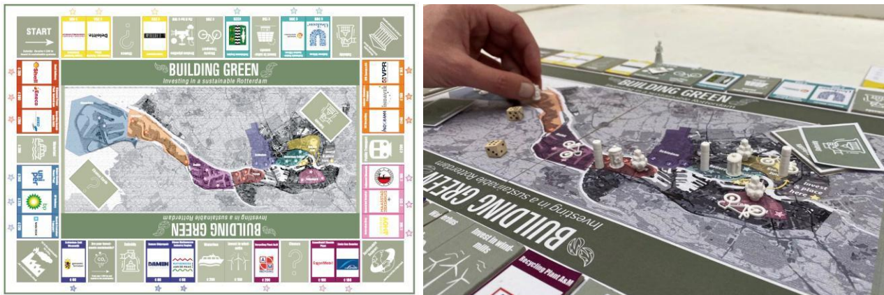
Figure 5. The game "Building Green".