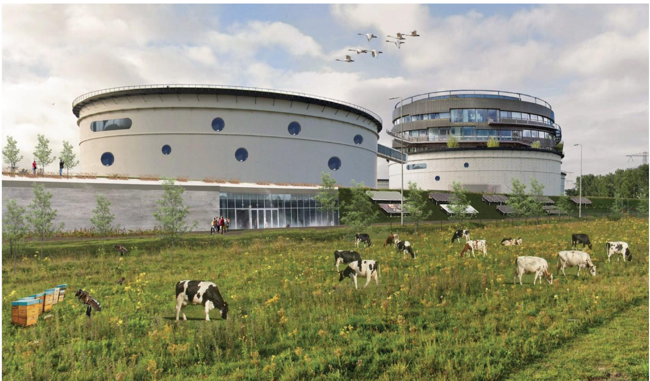
Figure 2. Dwelling or Offices | Impressions.

This section attempts to answer these questions by analyzing scenarios. Scenarios are a particular form of prevision. They propose to look at the future through "what if" questions allowing for a different narrative. More specifically, they permit different stories to coexist and they help to create a new vision 32 .