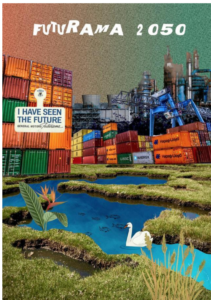
Figure 4. Futurama 2050 , poster promoting a new vision of future. (Source: AR2HA011 Building Green: Past, Present, Future - Khalil Amrani, Emily Manche, Marianna Moskal, Bartosz Teodorczyk).

Various initiatives at the European level, including ideas and regulations, have been proposed to make people realize that they must live more sustainably with the planet 33 . However, path dependencies seem to work against cultural, economic and environmental transitions. If sustainability is framed as a cultural construct, one group of students argued that we need to build awareness both of what a port is and its impact on the territory. They presented a game with the ambition of building more sustainable scenarios (Fig. 5). They argued that to reduce the large amount of CO 2 , emitted by the Port of Rotterdam- carbon emissions of 13.7 million tons annually 34 , - it is important to make people more aware of their impact on the environment 35 . The game took the game Monopoly as a point of departure since it responds to the materialistic and capitalistic culture to which our society belongs. The Monopoly model helps make the game more tangible, so that people can better imagine the transitions that take place while playing the game. The player can buy assets. These assets make revenues, from which taxes are deducted depending on emissions. These emissions are deducted from the player's account on a yearly basis, or in case of inspections, a fine can be issued if the values are above average. It is the player's intention to find a balance between sustainable investment and economic growth.