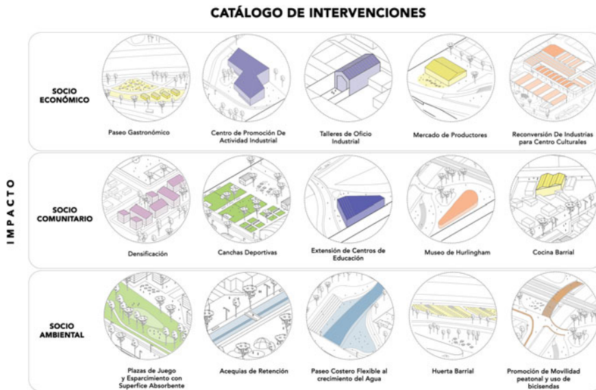
Fig. 11.4 Interventions for Morón River area. Drawing by Sol Cabanellas, Manuela Fontenla, Sofia Van Den Heuvel

in the urban transformation process. From this perspective, the actions were simultaneously a product of "...influence and integration, ceasing to be personal, direct, and momentary to position themselves in a system of trans-individual transformation, as the self-transformation, and the transformation of others are equally progressive, one being a consequence of the other." 15 Therefore, the result was an interdependent and polycentric network that embodies a continuous open and evolving process, social articulation and/or environmental remediation. This perspective of a city "in transformation" made it possible to establish, from a local dynamic of active interaction of sub-centralities, functional centralities, and of mobility, new operational functional links. These conditions arise from spatial demands and the potentiality of each place (determined by the people who use it and the environmental conditions) to be recognized, elaborated, and appropriated.