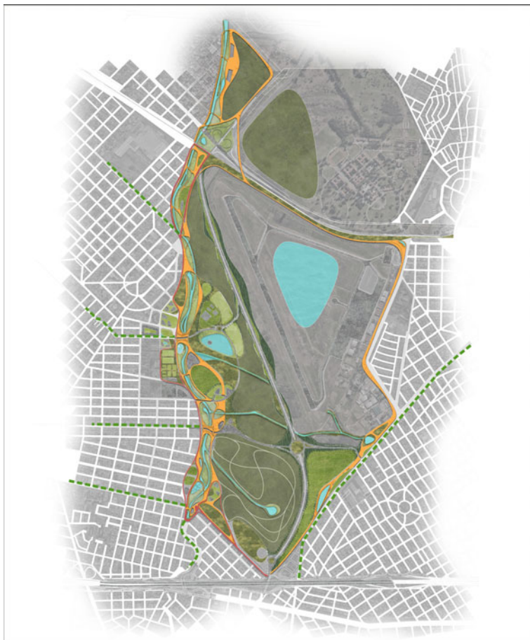
Fig. 11.2 River project with a strategy for socioeconomic transformation. Morón River area. Drawing by Sofia Videla, Agustina Cuoco, Valentina Gertiser

urban projects conceived as static architectural forms. Instead, it shapes them as dynamic transformations or journey forms. 14 In this understanding of design, the radical rootedness of a project refers to the etymology of the term “root,” deriving from the Latin word “radix,” generating the adjective “radical.” It distinguishes itself from “radicant,” used in botany to discern plants like ivy that grow secondary roots, plants that do not anchor in one particular place but react to whatever conditions arise, in a never-ending process. These plants develop through enrootings (a verb in gerund, dynamic), not based on a single root (a noun, static).