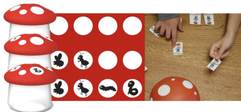
Figure 3. Left side: Design of the metaphorical feedbacks; Right side: User test

A working prototype was developed by using the Arduino Uno board ( www.arduino.cc ) in connection with an application developed by using the Unity3D game engine ( www.unity3d.com ). The connection is realised via a Bluetooth HC-06 module, which allows direct control from the application to the container. The developed board can convert the received values as inputs to the timer. After the user presses the lid, a button will be initiated to start the timer, which in turn, will release the light from zero to four LEDs. Projections of animated shadows of four different kinds of animals will then be displayed accordingly on the lid (as shown in the left side of Figure 3). At the same time, audio feedback as a safety reminder is transmitted and delivered through a piezo speaker.