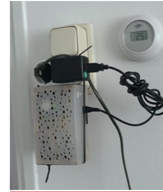
Figure 1: The monitoring boxes installed in the dwellings, developed by industrial partner OfficeVitae.

Each of the ten dwellings was fitted with three monitoring devices [Figure 1]. These sensor boxes record and transmit the measurements for indoor temperature, levels of CO 2 , and humidity in 3-minute intervals. One of the three sensor boxes was placed in the living room, one in the kitchen, and one in the front room. Bedrooms were not monitored because the ethical approval for the study had to be obtained within a short time frame.