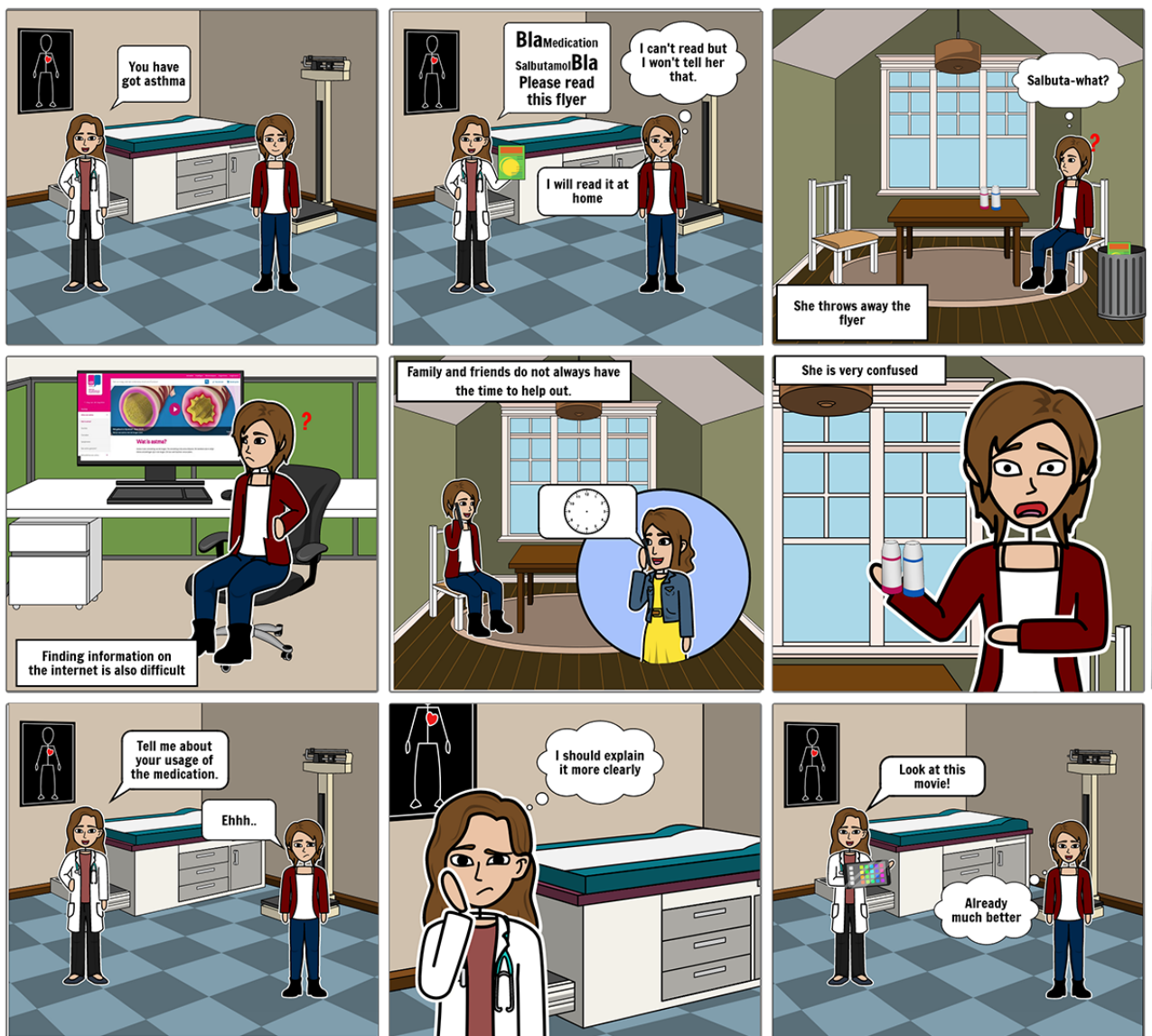
Figure 2. An example storyboard used during the co-constructing story sessions (translated into English).

Two participants with asthma and LHL participated in the co-constructing stories sessions. The sessions took place at the facilities where the participants worked, lasted approximately 1 hour, and were audiorecorded. Observations and impressions about reasons for nonadherence and the co-constructed stories were collected in the form of a written report after the sessions. Using the storyboards, we asked nondirective questions such