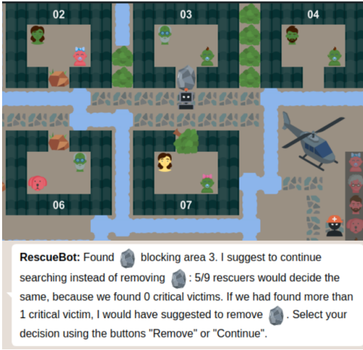
Figure 1: Cropped image of the world used during our study.

Whenever RescueBot found an obstacle or victim, it provided decision support using suggestions and explanations based on crowd sourced data (Figure 1). More specifically, nine people were shown our environment, confronted with task dilemmas, and asked to make decisions and which features contributed most to these decisions. We used this data to generate one suggestion and confidence explanations, feature attributions, and counterfactual explanations. Next, we manipulated communication of these explanations by implementing non-user-aware, trust-aware, performance-aware, and workload-aware agents. The non-user-aware agent did not model the human user and for each decision randomly adapted its provided reasoning information. The trust-aware agent modelled user trust in the agent based on the number of followed and rejected agent suggestions. This agent increased its provided reasoning information when predicted trust decreased (and vice versa) [4, 16, 29]. Next, the performance-aware agent modelled user performance based on the difference between the predicted and real-time score of the task. This agent increased its provided reasoning information when predicted performance decreased (and vice versa) [4, 16, 29]. Finally, the workload-aware agent modelled user workload during the task based on cognitive and affective load [6, 19–21]. This agent increased its provided reasoning information when predicted workload decreased (and vice versa) [4, 24, 28].