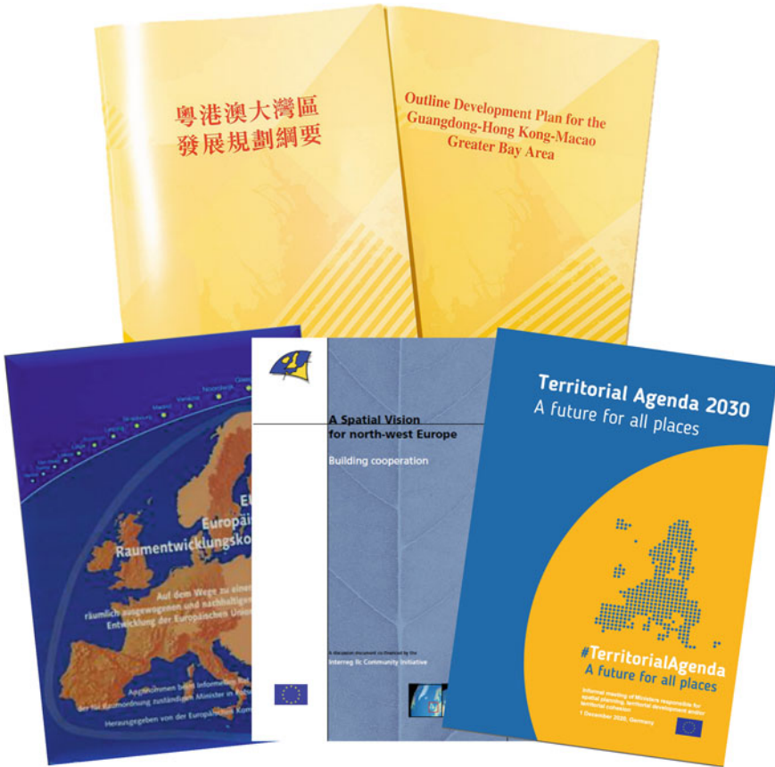
Fig. 4.1 Strategic planning documents in Europe and the Pearl River Delta. Clockwise from top left, outline development plan for the Guangdong-Hong Kong-Macao Greater Bay Area (Chinese version and courtesy translation into English; Greater Bay Area development office, 2019); Territorial agenda 2030 (European Commission 2021a, b); A Spatial Vision for North-west Europe (NWMA 2000); and the European Spatial Development Perspective (CSD 1999) (German edition)

despite various coordinating mechanisms, often pays scant attention to other sectors. Sub-national and local governments also make policy within their jurisdictional compartments—the geographical scope of their power. Their policies will often reflect competition with their neighbouring authorities rather than complementarity. This are a long-standing barrier to effective governance of the territory (European Commission 1998). Policy making in discrete sectors has advantages, it is certainly less costly than seeking coordination, and integration with other sector policies may dilute central objectives (Peters 2018; Candel 2021). It is inevitable that the complex