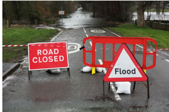
Fig. 4.3 Flood warnings in England

recession. There has also been resistance where there is a strong urbanist or architectural tradition in planning, and where more neo-liberal attitudes prevail. Nevertheless, there is evidence that the notion of 'the spatial planning approach' has been influential. By the late 2010s, cross-fertilisation was more intensive, not just information sharing among sectors, but involving active cooperation and sometimes coordination of policy (Nadin et al. 2018). Improvements have been gained by bolting on ad hoc tools to the planning process, such as impact assessments of policy, requirements for conformity among plans, joint working on data and analysis and ad hoc cooperation platforms. In some countries, the scope of plans and strategies has been widened.