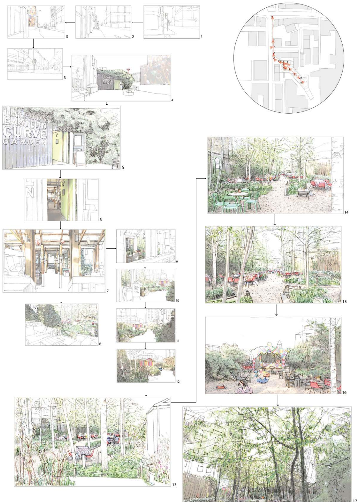
Figure 6 The design seen through the material lens—the sequence of experience. On entering the garden from the outside urban street, it can be directly perceived as an urban oasis and outdoor living room. The rich material world of nature and social practices intrigues people as they move through the garden.