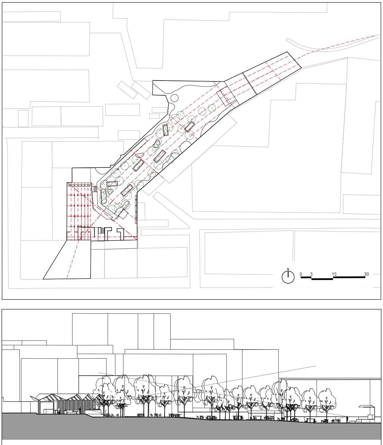
Figure 5 The design seen through the morphological lens. The spatial design took the curving geometry of the existing site as the essential element for the composition of the garden. The pavilion was elevated to the same level of the outside urban street, with the garden's ground descending to the end. The trees are planted to enhance the enclosure of the site as well as the descending effect of the ground.