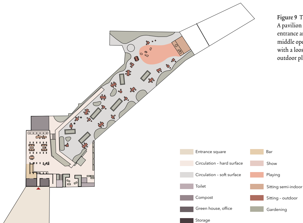
Figure 9 The design seen through the social lens. A pavilion with indoor activities is situated in the entrance area and the outdoor sitting is located in the middle open ground. The end of the garden is provided with a loosely defined area, which can be used for outdoor playing and cultural events.