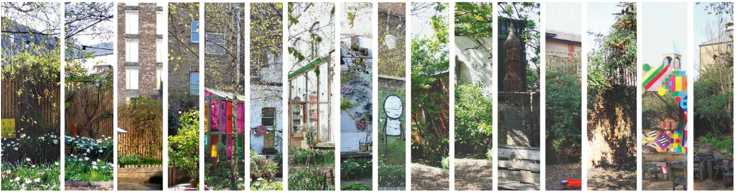
Figure 7 The design seen through the material lens—the border condition. A material juxtaposition of old and new can be observed along the garden's border, which exposes the transformation of this leftover space and reveals traces of everyday life in the surrounding neighbourhood.

An unexpected effect of the design is found in the material juxtaposition of old and new at the border of the garden. Because of the limited budget, the design's focus was mainly on the middle area of the garden, and the construction of the borders was reduced to the minimum, leaving the original border exposed. Some parts have new bamboo fences and planting, presenting a more unified image, at other places the existing, fragmented situation of the original border is visible. This imperfection in the design intervention raises an interesting contradiction (Fig. 7). Compared with designs that radically refurbish leftover spaces into publicly accepted formal spaces, the sober and minimal material change here allows for a hybrid and layered experience of both a familiar living room and an unfamiliar leftover space.