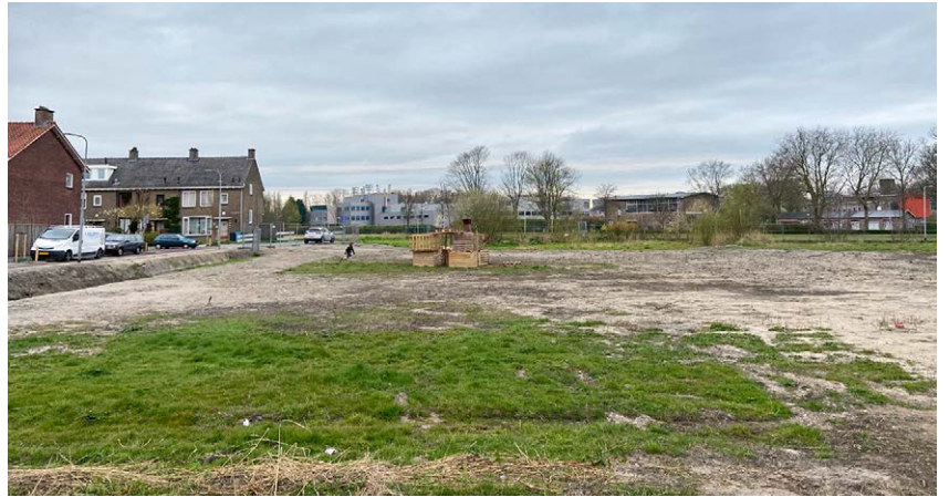
Figure 1 a-d A leftover space along Jaarweg, Delft (NL). Although 'un-designed', the spontaneous play of neighbourhood children and the natural succession of wild grass lend the site different profiles throughout the year.