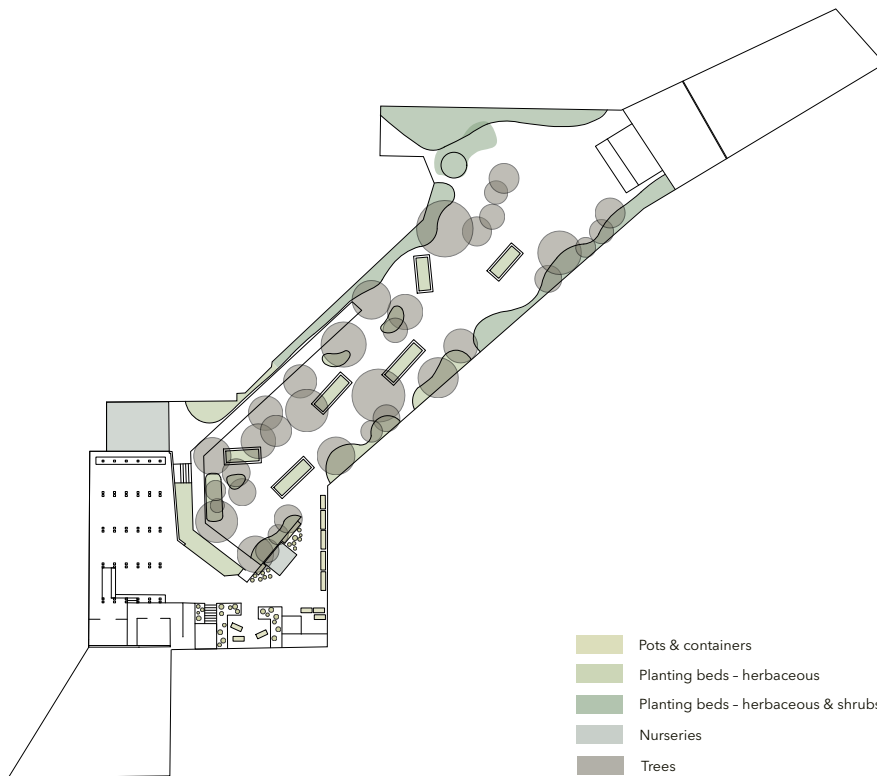
Figure 8 The design seen through the ecological lens. The design transformed the previous wildness into a place of horticulture. More diverse forms of planting were introduced, provided with different growing conditions.