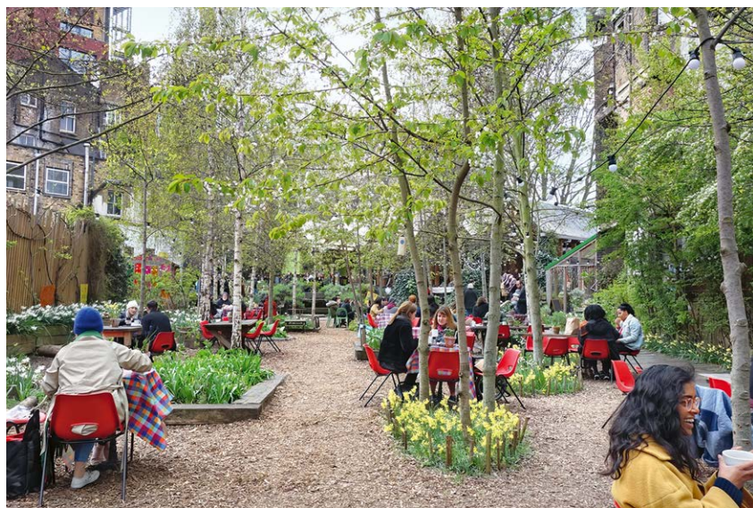
Figures 2a, b Before the design and the current Dalston Eastern Curve Garden. Transforming the previously hidden abandoned railway land into a communal garden, the design preserves the green identity of the site, a secret world in Dalston's centre, with a lush image of nature.

patory sessions with local stakeholders and activist social groups provided manifold inputs for conceiving the final design of the site. The design transformed a small section of previously abandoned railway land into a green oasis, an animated public green space for the neighbourhood (Figs. 2a, b).