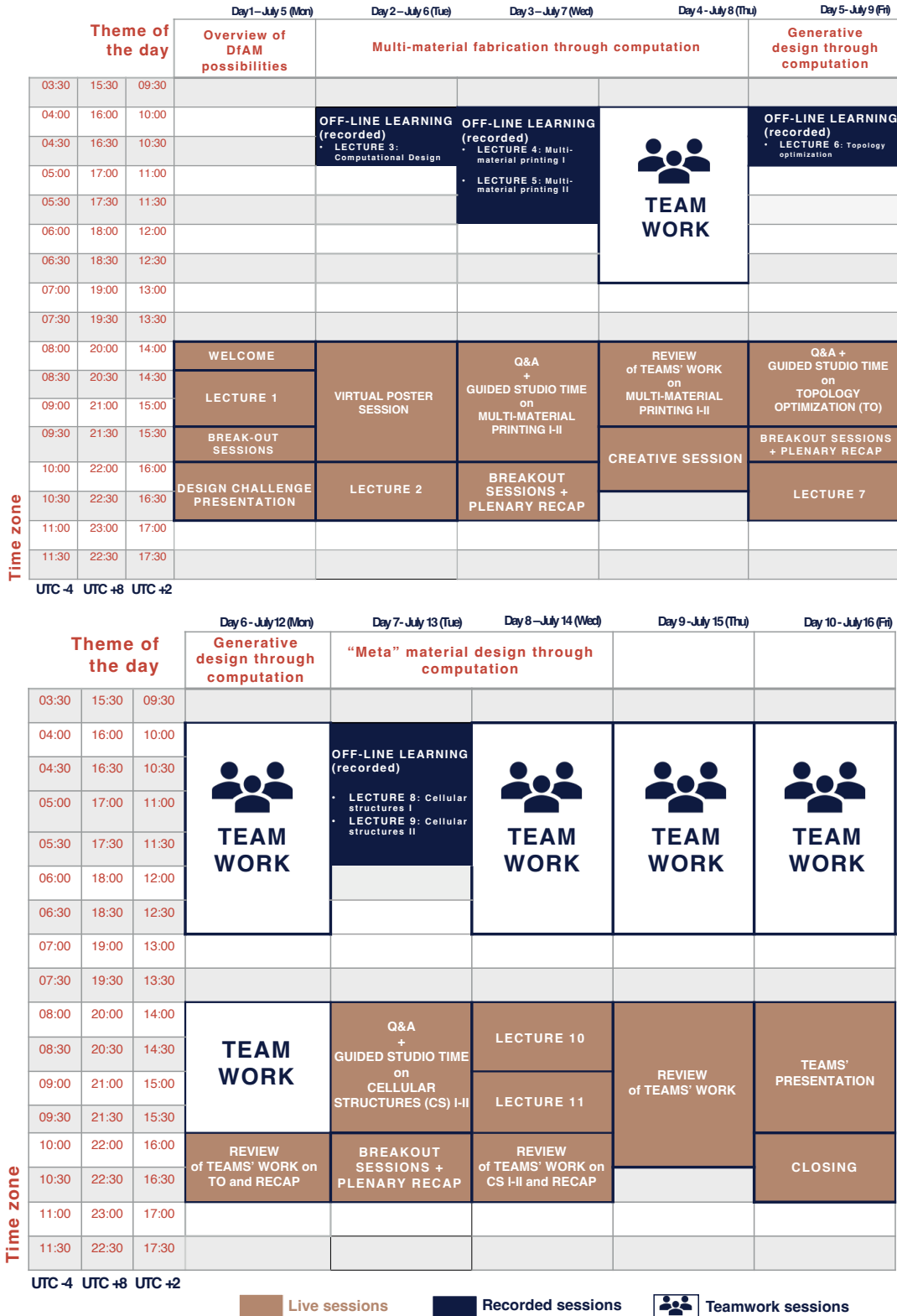
Figure 1: The summer school structure (2021 edition). It is based on the flipped classroom approach as an intensive two-week combination of: a) interactive live sessions involving lectures, guided studio

components of a bicycle. Students were asked to select at least one subsystem of the bike among those provided to them and implement the DfAM principles learned during the school. They were supplied with digital models of the following subsystems: the frame, the wheel, the seat post, and the fork with the front suspension. During the summer school, the participants learned the necessary theoretical background and skills required to solve the design challenge using computational methods and tools.