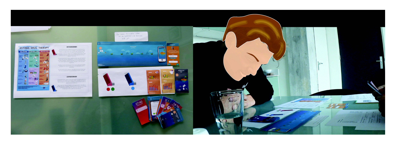
Figure 3 Paper prototype testing of the serious game Ademgenoot with a participant.

The paper prototype was also reviewed by two general practice nurses who commented on the clinical feasibility and provided additional clinical feedback. They expressed their enthusiasm and found the game to be feasible in practice. However, they pointed out that inhaler use may not always result in better asthma control. Therefore, it is important for healthcare professions and the serious game to manage expectations to maintain user's motivation to continue with the challenge. Instead of "promising" improvement it is important to reflect on the effect of behavior and asthma control