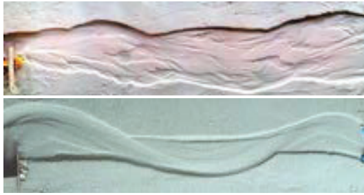
Figure 1. Channel development from straight in the laboratory with two different sediments: uniform sand (top) and poorly sorted sand behaving as cohesive at the flume scale (down).

In sand-bed rivers with vegetated floodplains, vegetation density strongly impacts the channel width (Fig. 2), whereas discharge rather affects the water depth (Crosato et al. 2022).