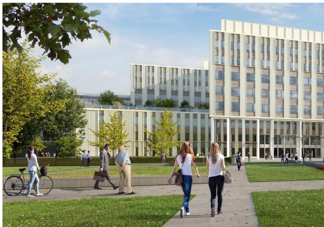
Figure 3. Impression of the entrance of the main building, which integrated the EBD principles of daylight, nature, orientation.

For the design of the inpatient rooms two separately funded studies were conducted to inform the design. The findings of these studies were applied in the design of the patient rooms. The studies were called “Ban Bed centricity” (Koenders et al., 2018) And “Room with a View/R4HEAL” (Hesselink et al., 2020). The studies focussed on better recovery of the patients, through integration of systems that enable patients to adjust the conditions of their rooms to their personal needs. The patients can regulate environmental stimuli such as lighting, shading, distraction through audio-visual entertainment. Also, their close relatives can stay (rooming in) for support.