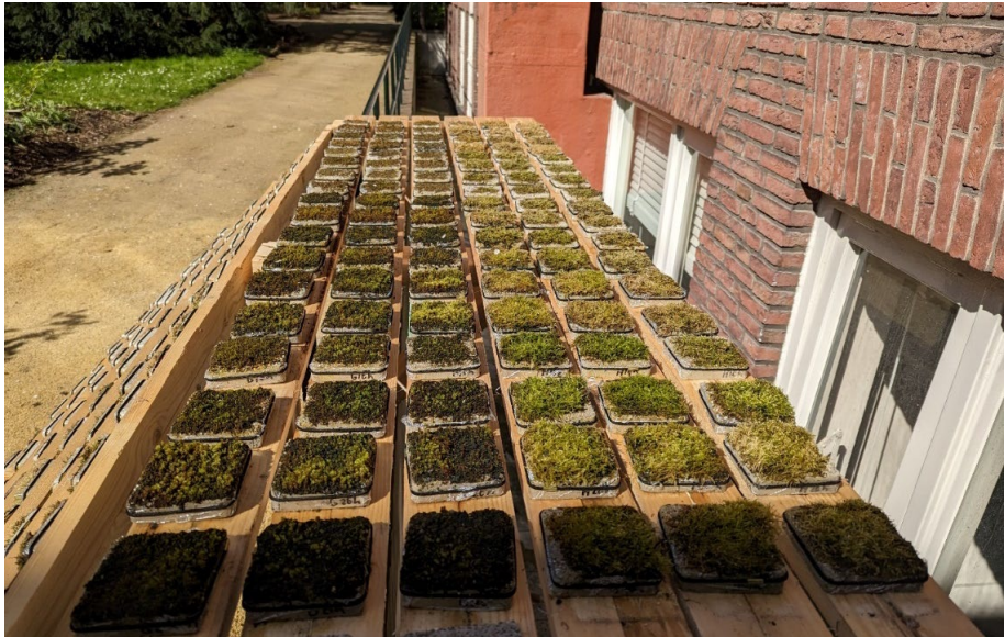
Figure 2. test set-up used to stress-test different growing regimes

stressors), subsequent outdoor survival is often poor, as they seemingly do not develop the protection mechanisms necessary for survival under these harsher conditions [60, 62]. As such, cultivation and a regime for adaptation to outdoor conditions needs to be developed to ensure both rapid growth and long-term survival, research into which is currently ongoing by Veeger (Figure 2).