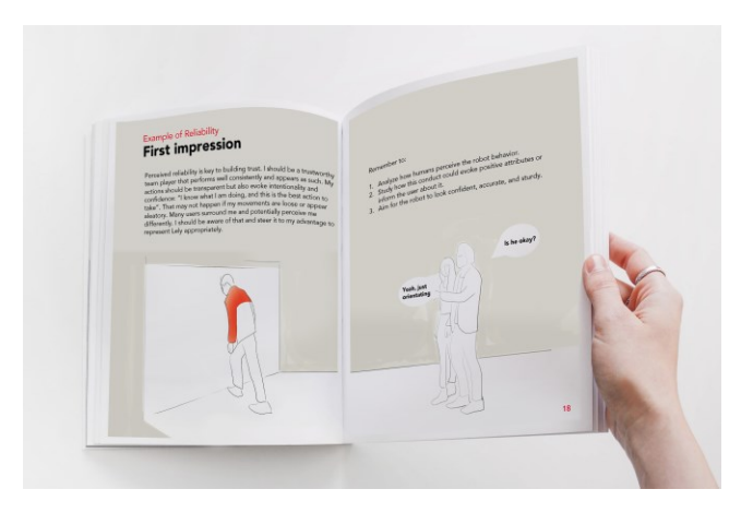
Figure 2: An example page from the Lely Code of Conduct for Human-Robot Communication

The final version of the code could be seen as a supplementary material to this paper. It is a document with 13 stories for representing the five values intended for supporting developers to design human-robot communication for the dairy farming context (Figure 2). The code was evaluated by 27 Lely employees, assessing its benefits, fit to developers' workflow, usability, and integration within the company. At the moment of writing this paper, the code is actively used at Lely as part of the requirements in new projects and to document functional requirements that ensure portfolio-wide consistency. The company also created a new function, robot interaction designer, provided by the increased awareness that the document fostered.