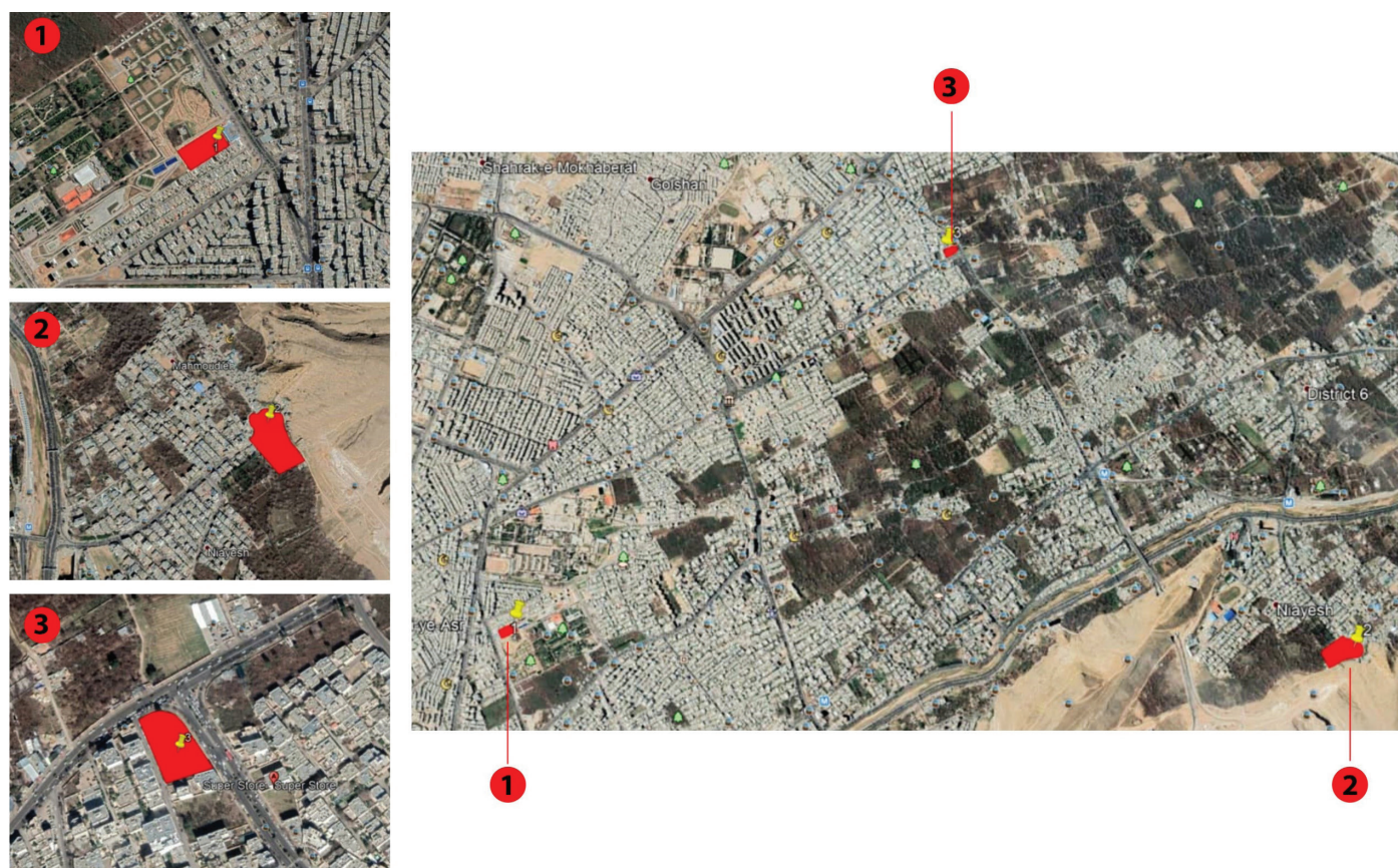
Figure 1. Locations of the selected sites in Shiraz: 1) Be'sat, 2) Niayesh, 3) Ghoddosi.