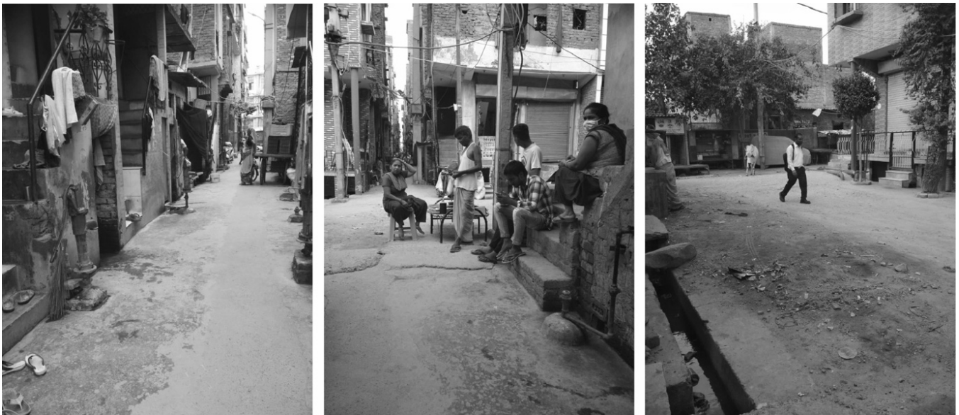
Figure 2: The streets are an extension of household and other social activities.

I feel safe walking back home on Fridays because there is a Friday market on the way, and there are many people around. Neelu, 23, beautician