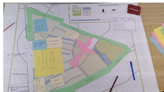
Figure 2: Example output game

During the game, the participants made a visual representation of their proposed vision (see Figure 2 for an example). The vision analysis showed that all the visions contain transformative elements. Per vision, transformative elements were identified and grouped using circular economy principles and the related pillar(s) of the Circular Economy framework [17]. All vision proposals do contain clear principles relating to the circular economy that could be used to formulate goals or guiding targets in a follow-up workshop. All CE pillars were addressed at least once. The pillar materials was addressed most often (8x), followed by society & culture (6x), value (5x), biodiversity (4x), health & wellbeing (3x), energy (2x), and finally, water (1x). However, none of the visions contain any explicit goals or guiding targets. The results of the vision analyses can be found in Table 1. The detailed visions can be found in Frens [21].