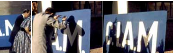
The Death of CIAM, stills from the 16mm film by Jaap Bakema