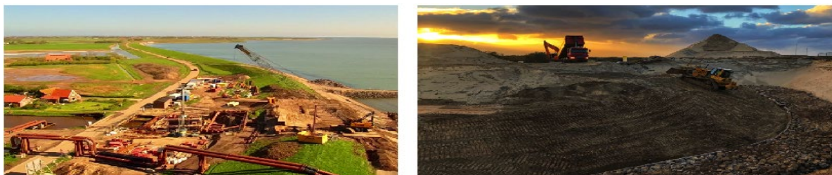
Figure 4. Reconstruction Texel’s East side sea-dike [right], and pump capacity [left] [Source: HHNK].

According to the HHNK Waterauthority [in Dutch, HHNK stands for Hoogheemraadschap Noorderkwartier], responsible in the area for maintaining the safety of the island, the outside sea-related defence system and the inner island quantity and quality water situation, the reconstruction of the east side sea-dike has started in 2019 and, therewith, the capacity of the polder pumping stations was started to be upgraded [https://www.hhnk.nl/waddenzeedijk] (see Figure 4.).