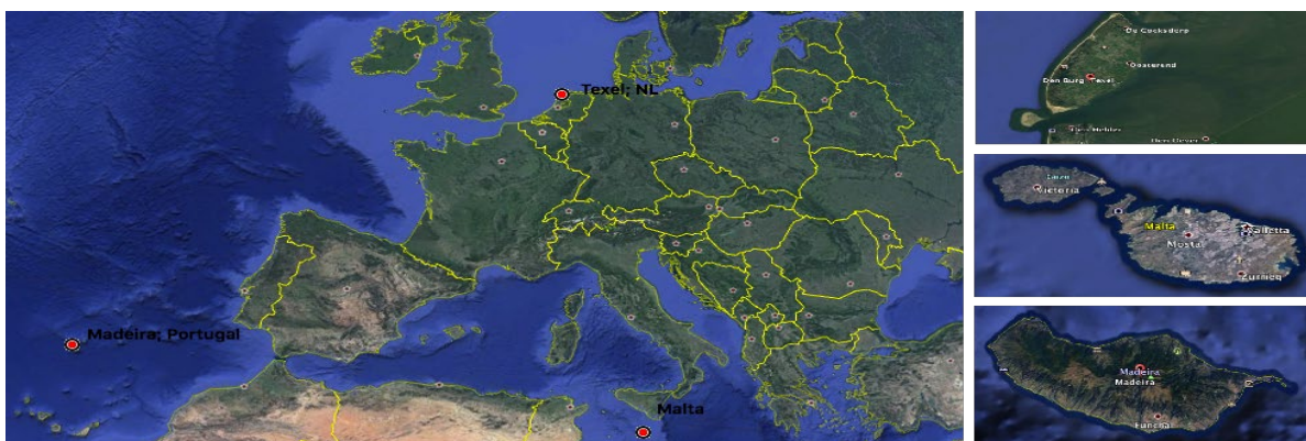
Figure 1. The islands Texel, Madeira, and Malta (from above to below); [using Google Earth].

Therefore, three islands spread over the EU continent were chosen: Texel in the Netherlands, Madeira in Portugal, and Malta (see Figure 1.). Because these islands are situated in sea areas under pressure of aggressive weather and water related conditions, there are climate-change programs on these islands in operating the stimulation of awareness under the local residents. Their relatively small size fosters the researchers' local scientific contacts to sustain the results during the research progress.