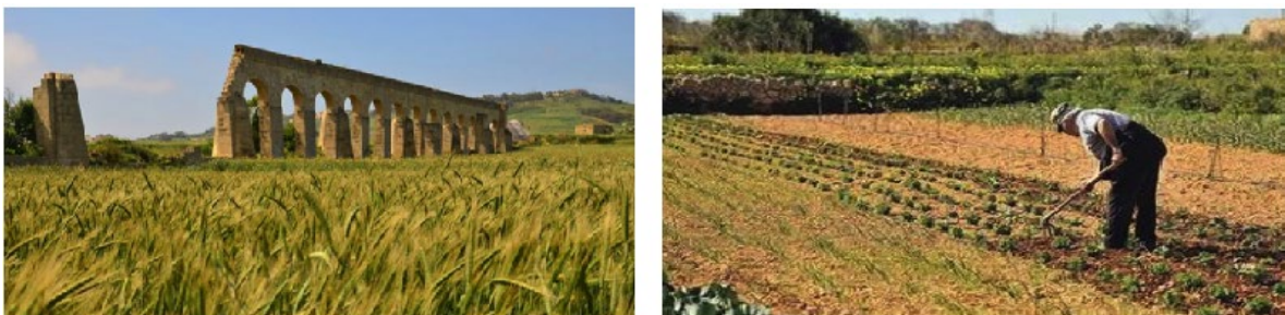
Figure 8. Impression of the innovation fields in the Gozo island of Malta (Wheeler, 2013).

The local agricultural sector is also taking the initiative, with a mix of 'autonomous' (individual farmers) and more strategic joint measures of which the initiatives on Gozitan are a good example (Bryant et al., 2000), with accommodation strategies like crop diversification, and change of the growth calendar (Wheeler, 2013), and innovative initiatives such as developing crop, heat, salt and drought tolerant crop varieties (Caldies and Caldies, 2016) (see Figure 8.).