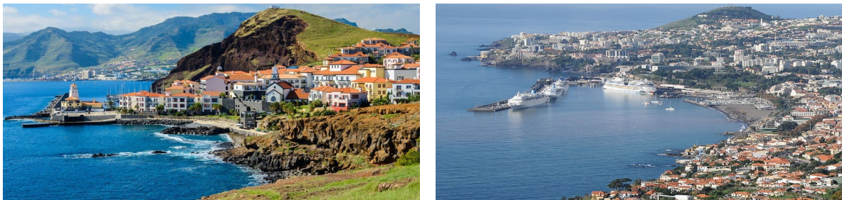
Figure 6. Madeira-Marina (left); and Madeira-cruise Funchal (right)

Madeira is an archipelago with a population of around 250 000 inhabitants in 740 km 2 , and is composed of 2 main islands. Madeira (the largest one) and Porto Santo, more to the Northeast (the smallest one). Madeira island is located at the latitude of the Northern African coast (32° 45'N of latitude and 17° 00'W of longitude), and its terrain is structured by volcanic origin, with rugged orography: high peaks and deep ravines.